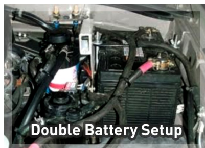
Double Battery Setup