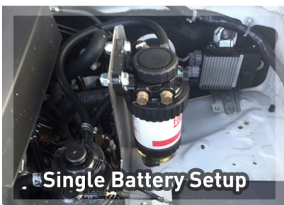
Single Battery Setup